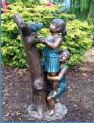
You can visit the Discovery Garden year round, to see the variety of plants and flowers (something is always blooming).

For the fifth year in a row, the Discovery Garden Plant Sale is once again a success story. The plant sale raised more than $3,400, the largest total in the history of the plant sale. The sale at Legion Memorial Park in Hollidaysburg included items such as annuals, perennials, vegetables, herbs, terrariums, stepping stones, birdbaths, and a hand crafted planter and birdhouses.